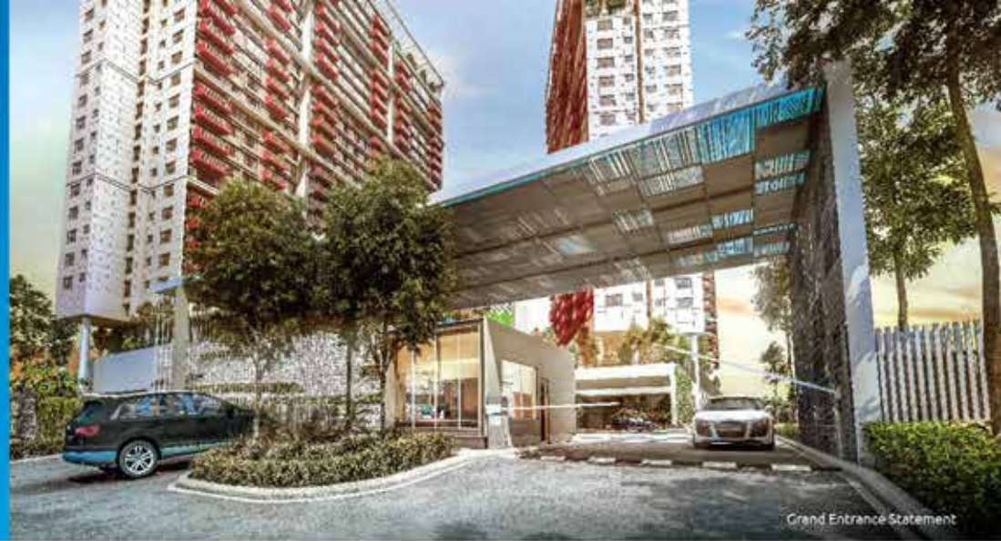
Grand Entrance Statement

The atmosphere continues at home with a stunning view from the balcony. Breaking away from the conventional linear layout, one of Paisley's two towers is structured with a unique curved design, angling away from the second block to maximise open area. The intelligent architecture creates personal space between residents while offering a panoramic scenery.