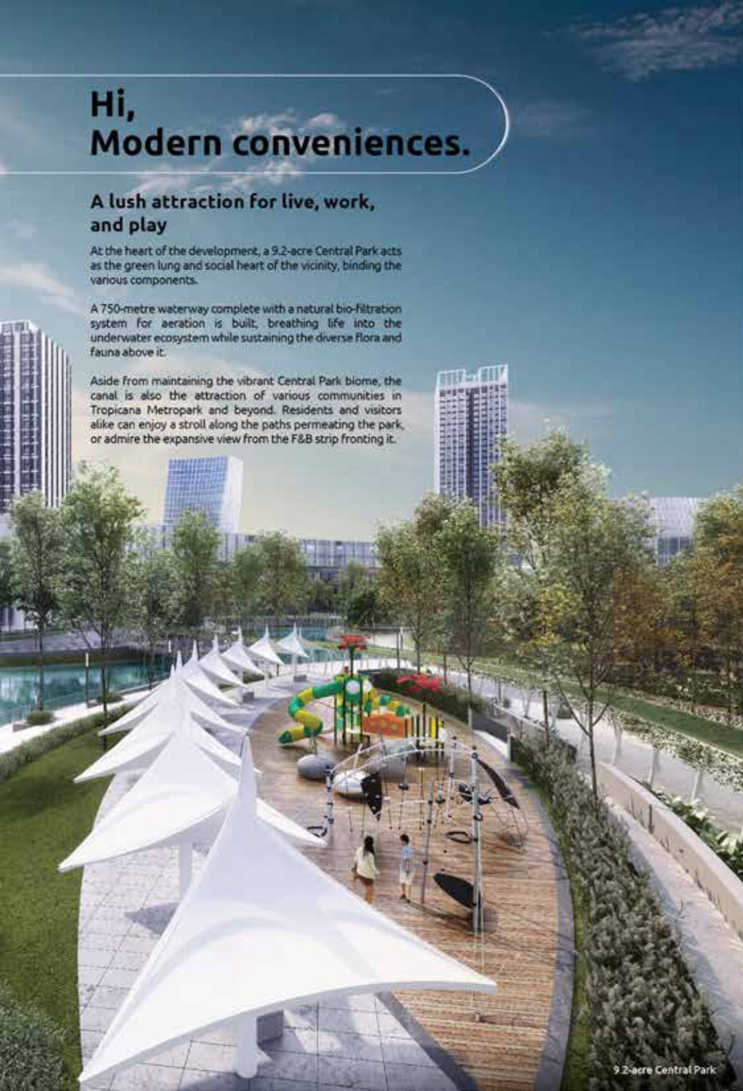
9.2-acre Central Park

Aside from maintaining the vibrant Central Park biome, the canal is also the attraction of various communities in Tropicana Metropark and beyond. Residents and visitors alike can enjoy a stroll along the paths permeating the park or admire the expansive view from the F&B strip fronting it.