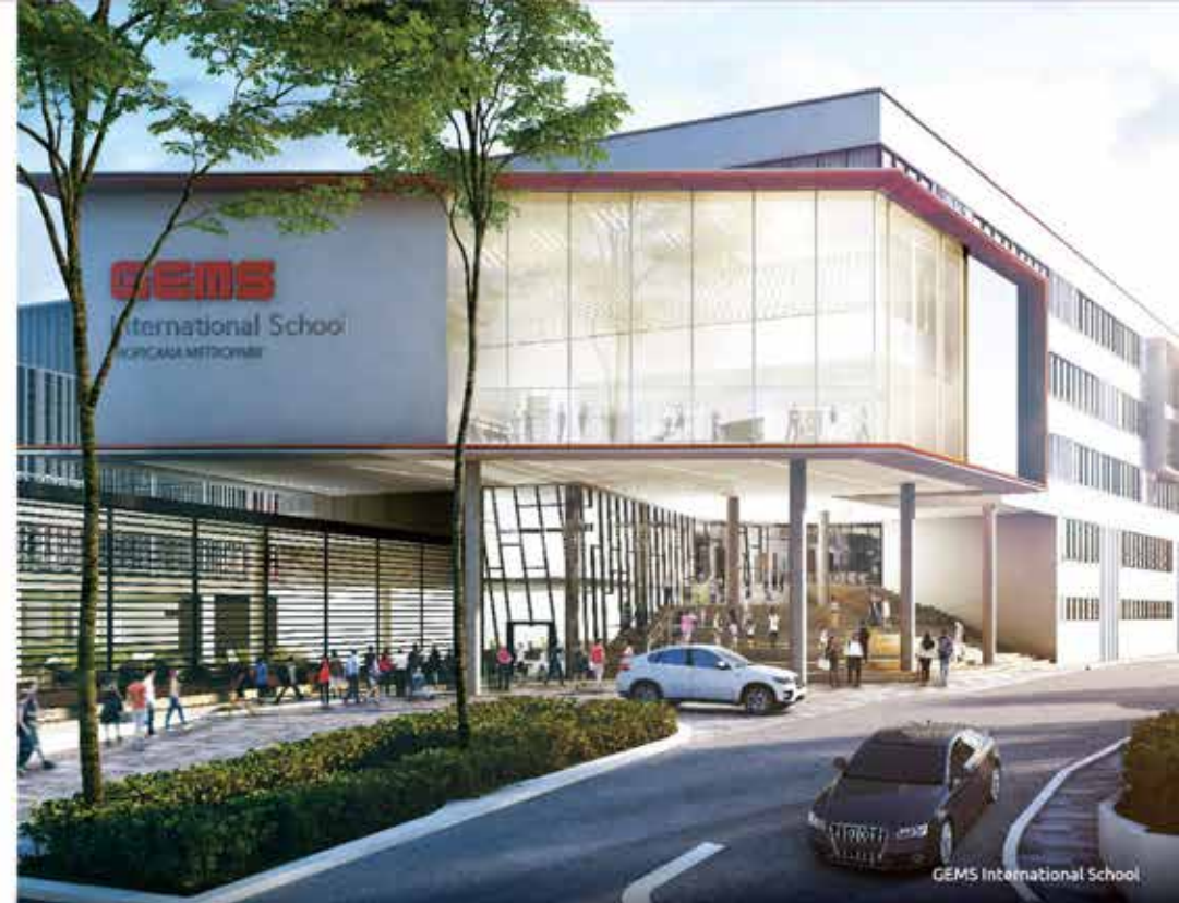
GEMS International School