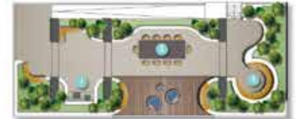
LEVEL 13A, TOWER A (The Hangout)