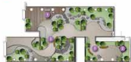
LEVEL 27, TOWER B (Panorama Terrace)