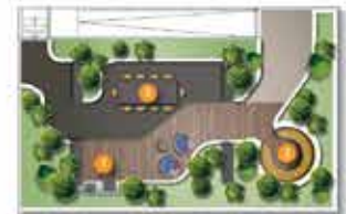
LEVEL 19, TOWER A (Urban Conclave)